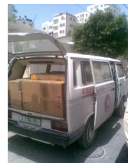
Medical supplies delivered to Red Crescent

The convoy, worth 60,000 Shekel purchased through donations in the framework of the Israeli Coalition Against the Gaza Siege, arrived at the Sofa Trade Crossing. The convoy includes laboratory and dental equipment. The equipment was intended for the Shifa Hospital in Gaza, the European Hospital in Khan Yunis, and Red Crescent for Gaza Strip.