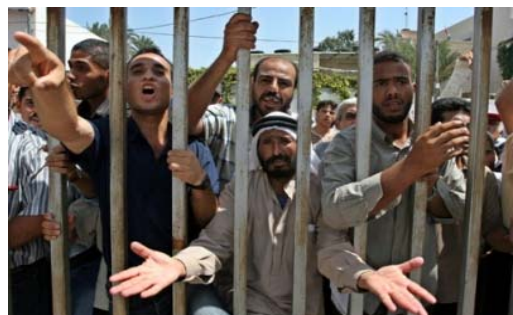
Palestinians imprisoned inside Gaza

At the same time, the British Department for International Development has warned that the situation is "extremely serious and that there are significant risks to public health."